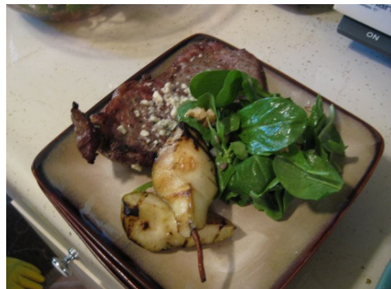
I made the guys grilled steaks with a blue cheese sprinkle, grilled pears and an arugula-walnut salad.

When the group arrived at the club, they discovered that Chode was playing. (Chode is a local ork/troll death metal band.) Scrup had tagged along and he was soon in head-banging ecstasy. Koz introduced Dillon to Keeze.